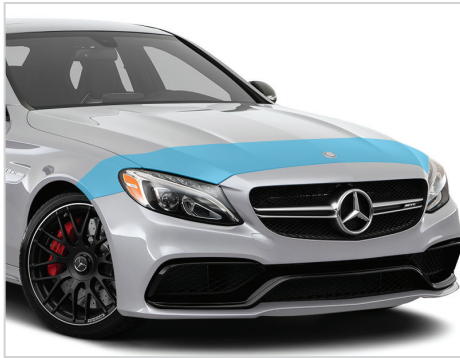
Partial Hood and Fender

Clear gloss polyurethane for stone chip protection, high wear, and abrasion in the automotive, motorcycle, RV, powersports, bicycle, aircraft, and other transportation markets.